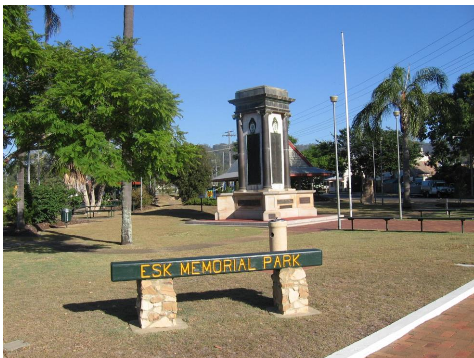
Esk War Memorial