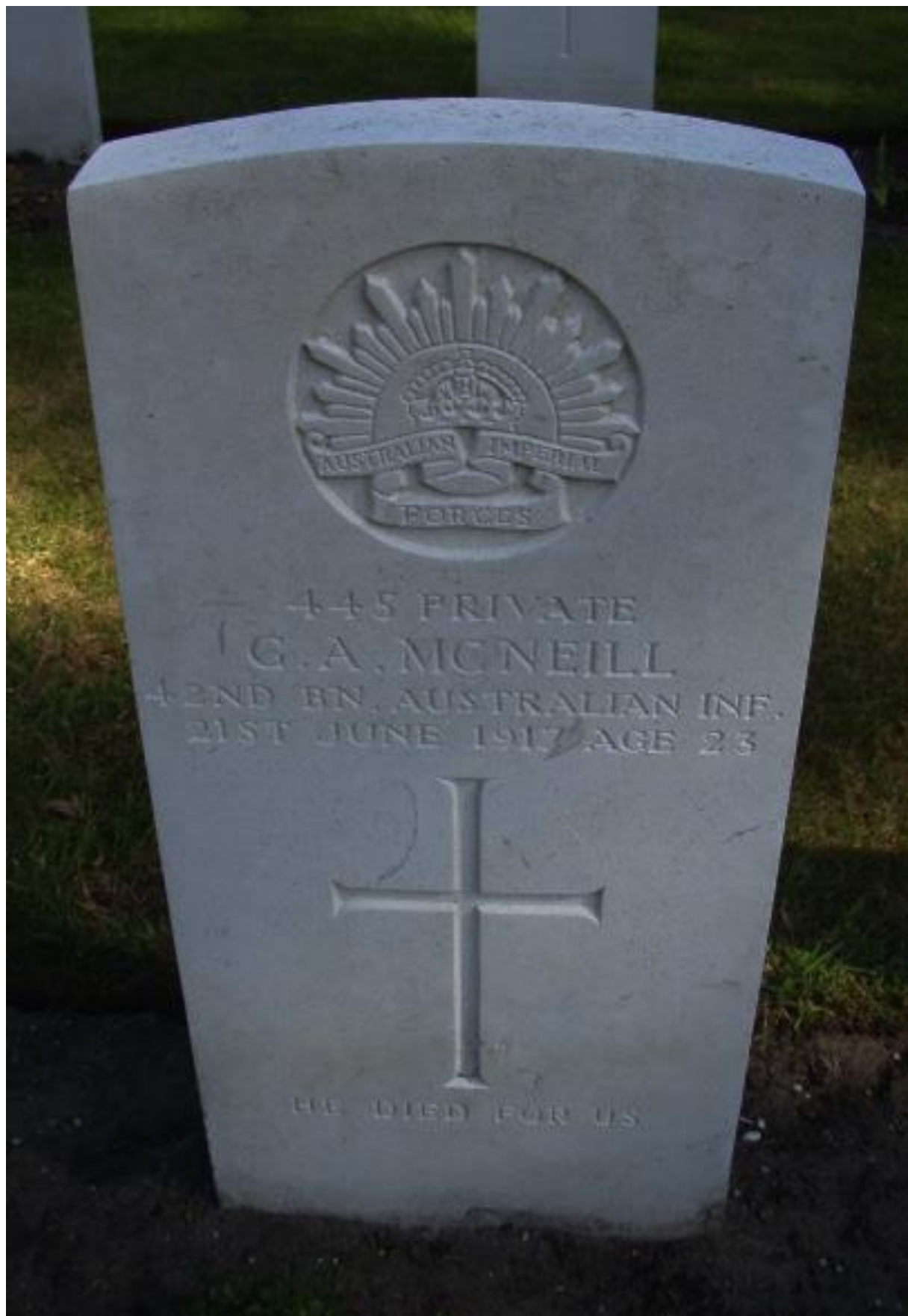
Photo of Private G. A. McNeill's Commonwealth War Graves Commission Headstone in Brookwood Military Cemetery, Surrey, England.